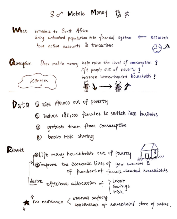
Fig. 3. Outline of the fourth research article.